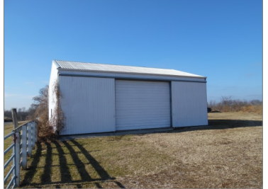
1280 square feet, concrete floor