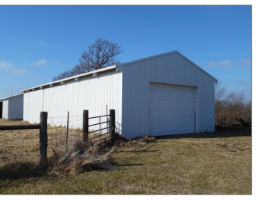
1664 square feet