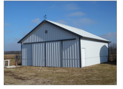
1050 square feet