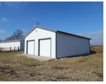
1064 square feet