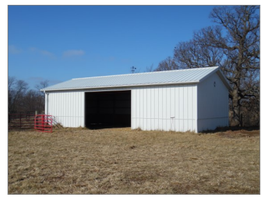
1404 square feet