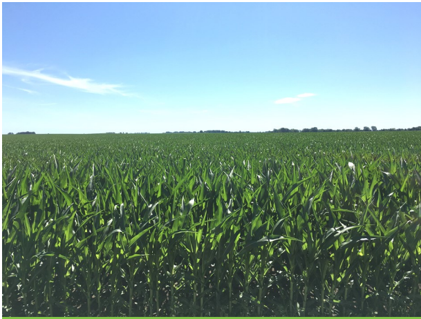
Very Quick Income from Crops