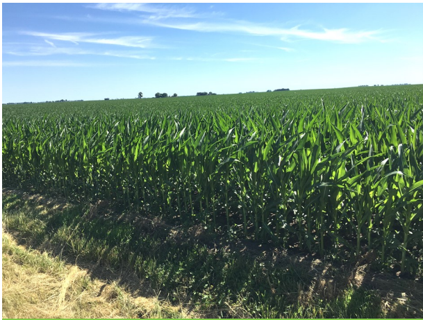
Entirely Class A Tillable