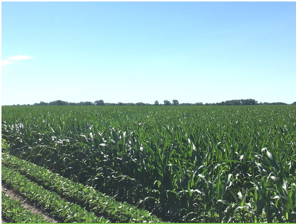
Excellent Yield History

2240 West Morton Avenue, Jacksonville, IL 62650 WORRELL LAND SERVICES, LLC