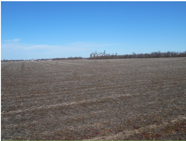
Excellent Access and Location Near Grain Elevator