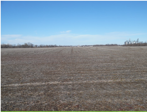
Class A Soils · 138.4 Productivity Index