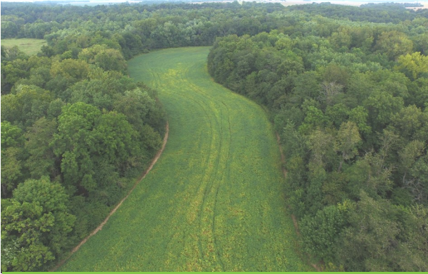
Secluded & Minutes from Jacksonville, IL