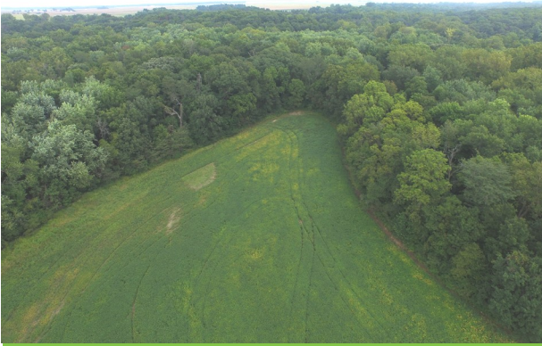
Excellent Recreational Value & Home Site Potential