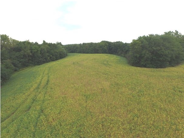
Income Generation from 8± Tillable Acres