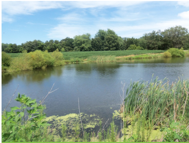
Secluded Recreational Enjoyment