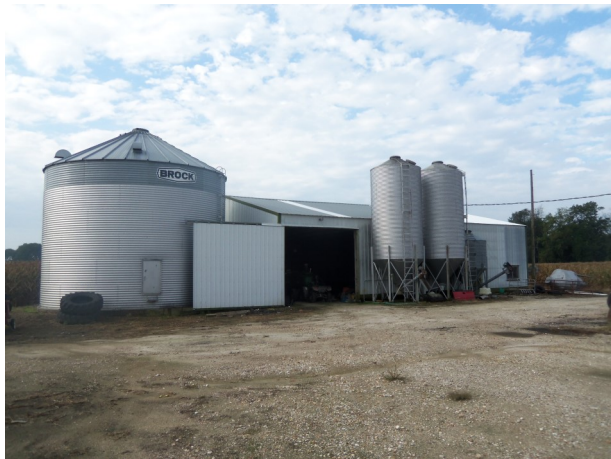
On-site Grain Storage

2240 West Morton Avenue, Jacksonville, IL 62650 WORRELL LAND SERVICES, LLC